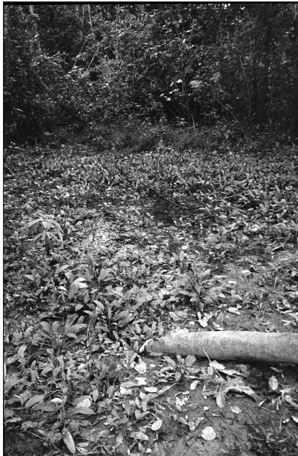
Figure 2. Old Echinodorus grisebachii field in Moena Caño, Peru.

fields besides harvesting have included weed removing and pesticide spraying.