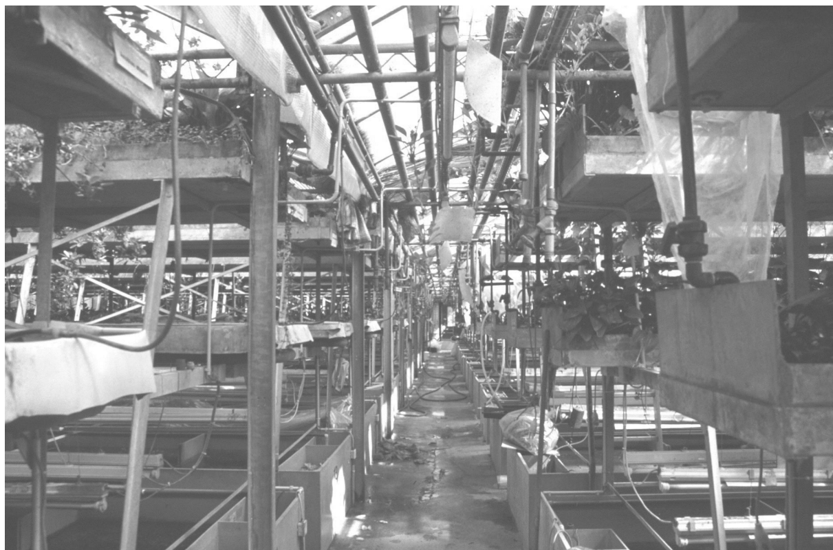
Figure 3. Modern aquarium plant nursery in Germany.

The largest aquarium markets are in the U.S.A, central Europe and Japan. All of the companies believed that the