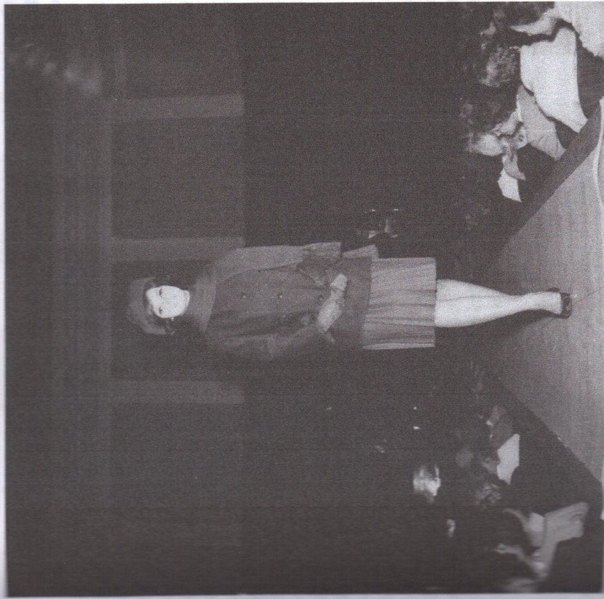
Figure 5.2 Telimena fashion show, 1962 (Poland)

The importance of the fashion shows was emphasised in an interesting manner. Image construction of the Polish clothing was conducted by representing luxury clothing that was not intended to be sold in large amounts in the Soviet market at all. The potential purchasers of Polish clothes were