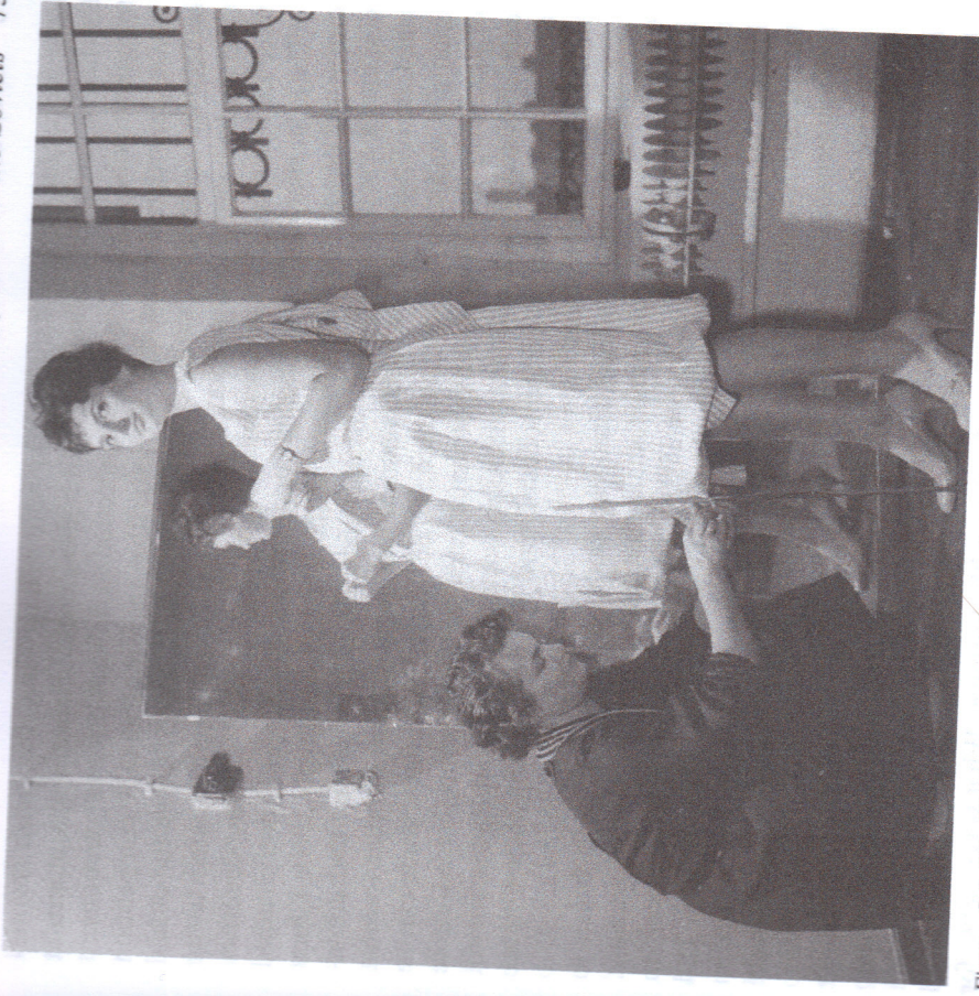
Figure 5.1 Working on the new design of a dress with a model: Fashion House Telimena in Łódź, 1960 (Poland)

In contrast to the 1950s, in 1961, the micro and intermediate actors in Polish foreign trade formed an efficient network and could thus influence the success of sales in the Soviet market. ZPO and factories worked to create an impressive collection that would sell, while specific designs and the prices paid for them were negotiated by the foreign trade company CETEBE. As became evident, the state-level bilateral annual commodity exchange negotiations