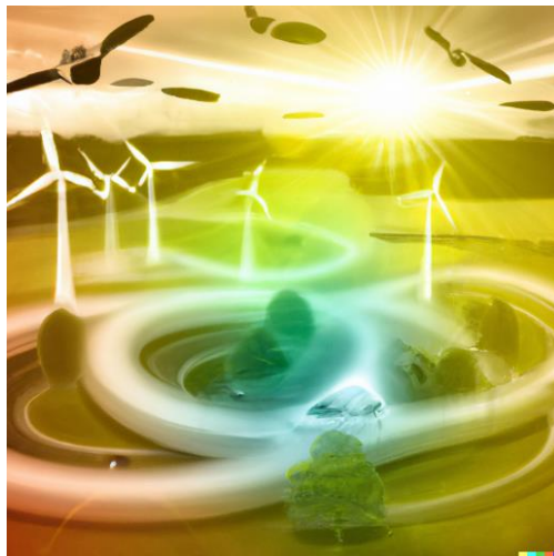
Figure 2. Green, technology-intensive Europe.

The European Union has advanced in a green transition across society and has gained global leadership in green technologies, resulting from aligned efforts. The EU is exporting the accumulated green knowhow and technologies and has become an engine for leading the world on a transition path towards a greener planet. Although past emissions continue to heat the globe, the world has avoided reaching major tipping points and the climate is gradually recovering. Europe is the global leader in the development and deployment of climate change mitigation technologies which, among others, reduce greenhouse gas emissions, generate renewable energy, and provide sustainable food production. Europe shows the way in the production of clean energy and its distribution to homes, businesses, and industries. Energy consumption is supplied by renewable energy sources (solar, wind, hydroelectric, and geothermal power) and nuclear energy. Europe is also excelling in climate change adaptation technologies that protect citizens against frequent, extreme, and severe weather conditions, such as heatwaves, floods, hurricanes, and forest fires. However, Europe has experienced a demographic shift. The population has aged and the total population has shrunk. Consequently, there is a low offer of labour, and specifically there is a low offer of green skilled workers. Job offers in renewable energy technology, green construction and sustainable urban planning are hard to fill.