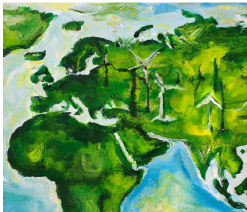
Figure 5. Green leapfrogging.