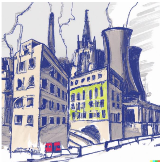
Figure 4. Feeling the pain.