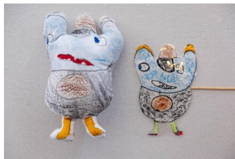
Figure 4. Mauro as a soft toy and a stick puppet

Figure 3 shows that during the intervention, the pupils used the first activity as a motivation for other activities, which supported the engagement and personal attachment to learning and having humour present throughout the process. In general, the pupils were happy with their characters. They did not seem to want to develop them further and copied them in detail as the learning process progressed. From the perspective of the effectiveness of the learning process, having the first activity as a motivation for other activities helped the pupils to focus on the subject-centred aims of the activities, such as designing the puppet or the soft toy. According to the teacher, the static nature of the soft toys was partly due to the instructions, as the pupils were guided to use the drawing as a model for the soft toys. In Figure 4, a character called Mauro is presented as a soft toy and as a stick puppet. Even though they were replicas of each other, they were unique compared with the characters of the other pupils and illustrated the personality of the child. Such a design approach necessitates a child's to plan, from the initial sketches to the product itself. This is notably more demanding than merely crafting based on a pre-established model.