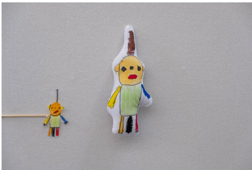
Figure 5. Pekka with three legs and three eyes

In general, the humour pupils produced during the first activity was in accordance with previous research (Aerila et al., 2023; Franzini, 2002), as it involved the most common expressions of school-aged pupils' humour, such as scatology, feature violation, hyperbole and applications of pupils' media culture. According to the results, most pupils seemed to think that scatological humour was funny to others and chose to use this stereotypical manifestation of humour (for more details on pupils' stereotypical humour, see Chapman et al., 2007; Loizou et al., 2011; Van der Geest, 2016). Most drawings contained illustrations of poop, which was usually an irrelevant detail that was just included to add to the humorous effect. According to Van der Geest (2016), the purpose of scatological humour is to provoke laughter by presenting a story or situation that is out of the ordinary and perceived as funny. This was also apparent in this study, with one child even saying that he drew a poop because it was usually funny to others.