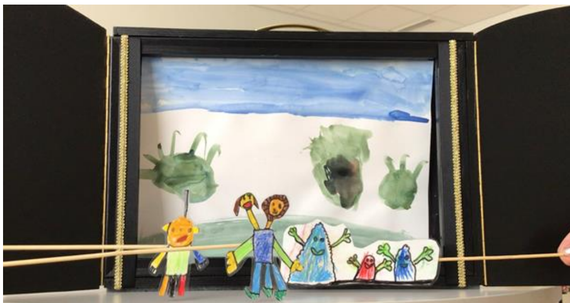
Figure 2. A screenshot of the kamishibai presentation