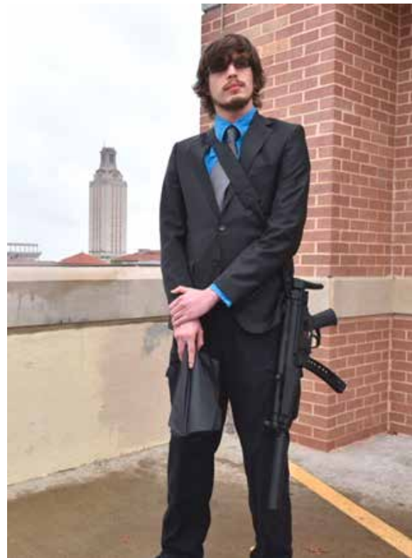
Image 2. Open Carry supporter with a pistol-caliber carbine. San Antonio Garage, UT Austin.